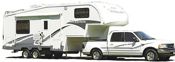
Fifth-wheel camper (Recreational vehicle)